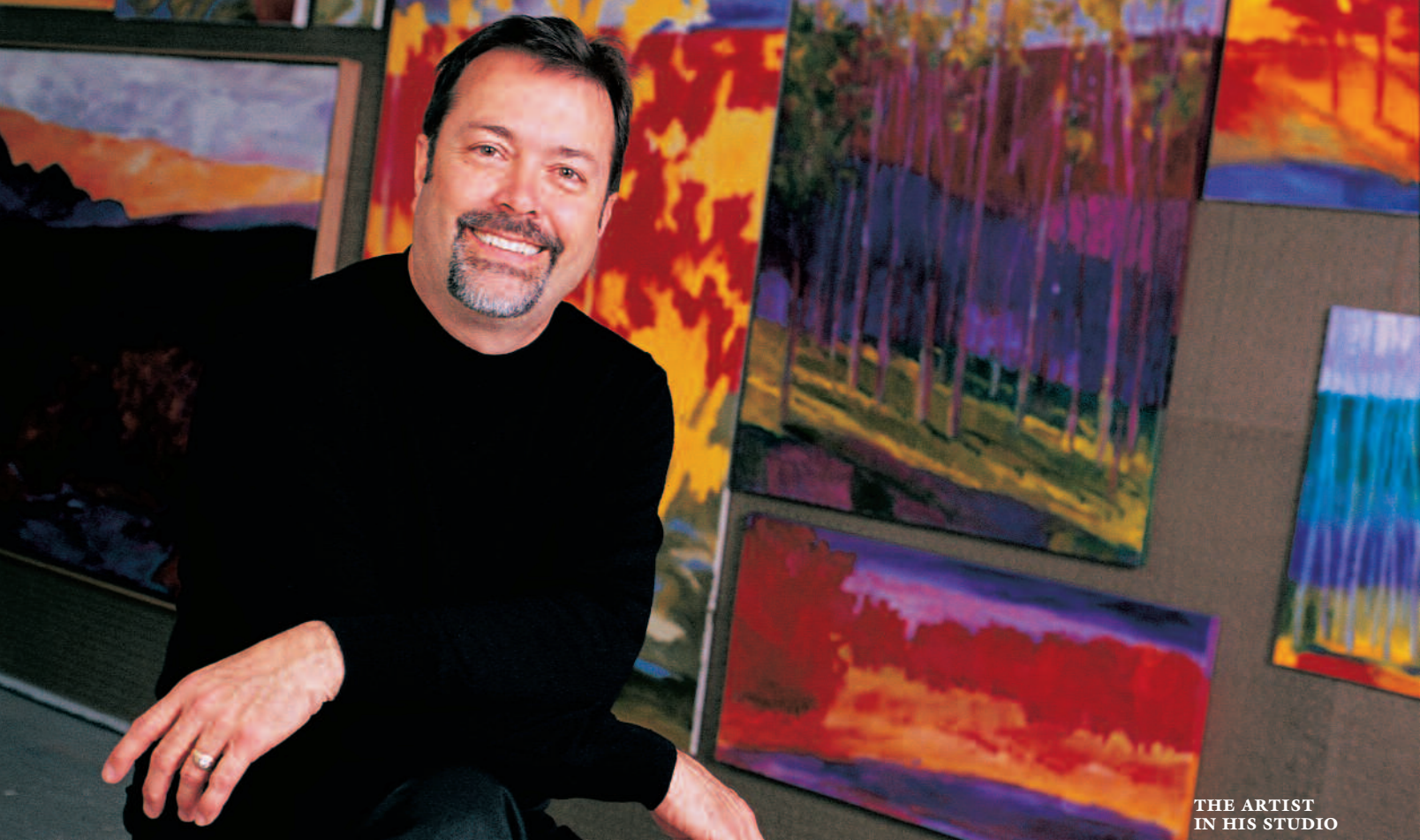
THE ARTIST IN HIS STUDIO